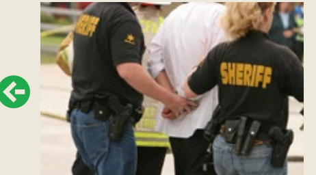
3. Suspects are arrested and currency is seized.

4. All seized currency is scanned with the JetScan iFX, any serial number matches are flagged in IMS or other central database. Doc Find lets you pull out the buy money, returning it right back to the agency for the next sting.