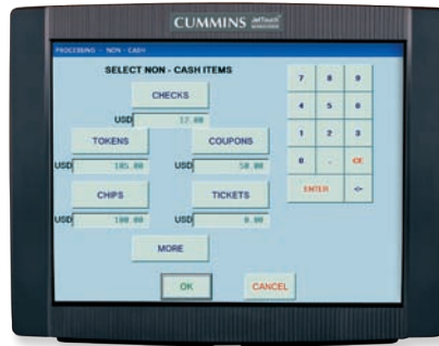
Data Entry Screen