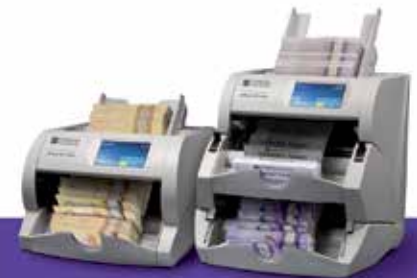
JetScan iFX i100

Detection: Auto size, automatic document type, MICR character no-read, piggyback, double and chain.