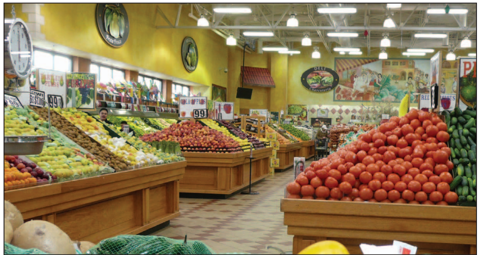
Lewis Fresh Market Produce Section.

The store prides itself on paying special attention to each customer from the time they enter the store until they pull out of their lot. The Cummins JetCoin has become a supporting partner in that overall experience.